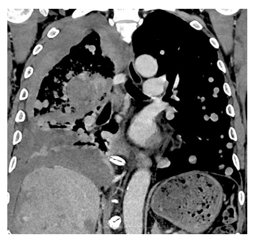
Fig. 1. Contrast-enhanced computed tomography showing a metastatic tumor rupture in the right lung.

Lenvatinib is an inhibitor of multiple receptor tyrosine kinases and is widely used as the first-line treatment for unresectable HCC. Hepatocellular carcinoma rupture related to lenvatinib treatment appears to be extremely rare [1], and