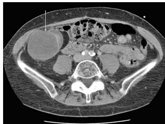
Fig. 1. CT scan shows a well-defined 6 x 6 cm gallbladder mass (arrow).

A 70-year-old otherwise healthy woman presented with one week of severe right upper quadrant abdominal pain. No significant abnormal laboratory result was detected. Computerized tomography demonstrated a well-defined, 6 x 6 cm mass surrounding the gallbladder wall, consisting of abnormal fat (Fig. 1). A cholecystectomy was performed to completely excise the mass. Gross examination revealed an enlarged and asymmetric gallbladder which measured 13 x 8 x 5 cm. A well-circumscribed myxoid mass occupied nearly the entire wall. The mass had heterogeneous yellow and tan fatty cut surface. On microscopic examination, the gallbladder was diffusely involved by a tumor displaying hypocellular, monomorphic, stellate or fusiform cells without atypia and occasional signet-ring lipoblasts in the background of myxoid stroma containing a delicate, arborizing, and "chicken-wire" capillary vasculature. These features are characteristic of a myxoid liposarcoma (MLS) (Fig. 2). No necrosis, increased cellularity or round cell component were identified. Fluorescence in situ hybridization assay demonstrated amplification of the 12q13 region containing the DDIT3 ( CHOP ) gene in 100% of tumor nuclei (Fig. 3). DDIT3 gene rearrangement was not identified. The post-operative staging by radiologic imaging did not reveal any metastatic lesion.