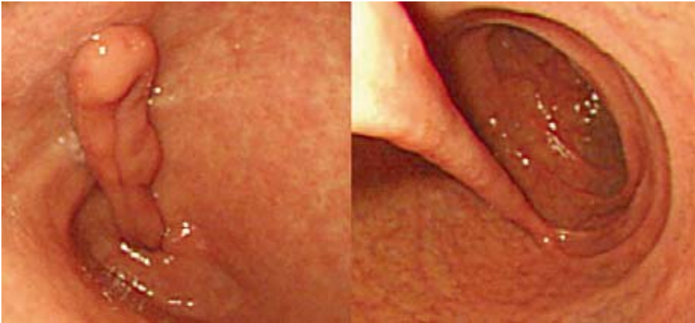
Fig 1. Endoscopic view of a semipedunculated polypoid lesion with protrusion to prepyloric antrum in the duodenal bulb.