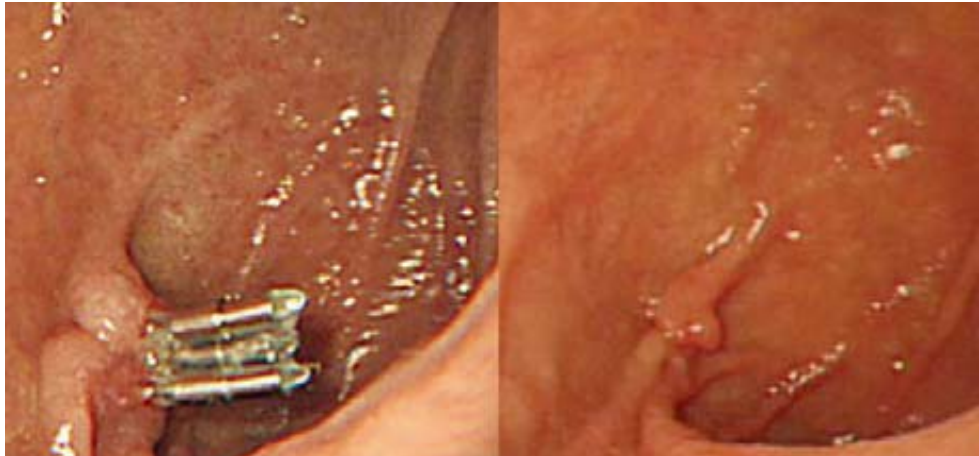
Fig 4. Scar of the previous mucosal resection site on follow-up endoscopy after 1 month (left) and 1 year (right).